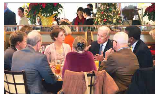
Vice President Joe Biden has lunch with Americans to discuss the importance of middle class tax cuts, at Metro 29 diner in Arlington, Virginia, Dec. 7, 2012.

Another reason I am so positive about the future: You! The Arc of Indiana is nearly 20,000 members strong, and growing. It is part of The Arc's history to tackle the tough problems at the local, state and national level. Together, we have met many challenges. And together, we will again.