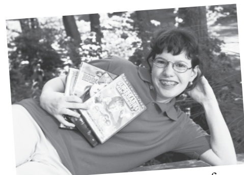
33 Young Adults Aging Out of Residential Program for Children

Photos from the Self-Advocates of Indiana 2007 picnic and calendars produced by The Arc of Indiana