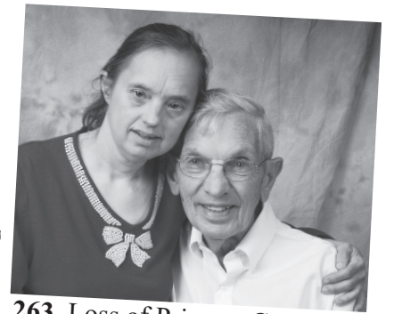
263 Loss of Primary Caregiver