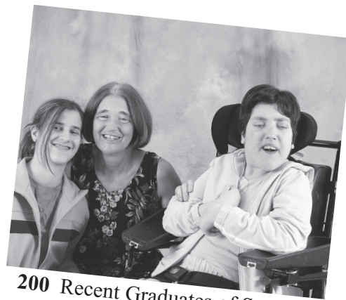
200 Recent Graduates of Special Education Programs