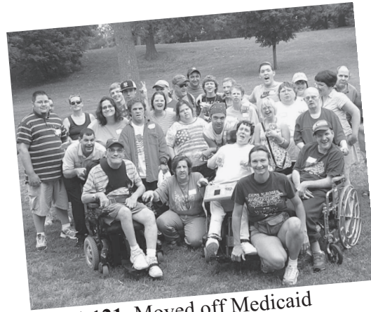
1,121 Moved off Medicaid Waiver Waiting Lists

Following are the number of people new to services in major categories.