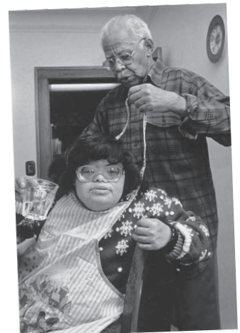
148 Caregiver Age 80 or Older