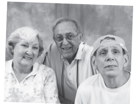
40 Moved Out of Large Institution