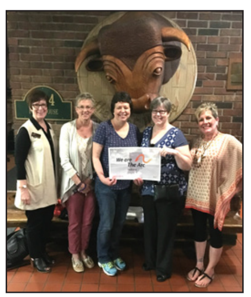
Fountain County ARC

Throughout the month of May, The Arc of Indiana and The Arc Master Trust staff traveled Indiana, visiting our 43 local chapters of The Arc. From large providers of services to people with developmental disabilities - like Noble / The Arc of Greater Indianapolis; Stone Belt Arc, The Arc in Monroe County; and ADEC, The Arc in Elkhart County; to smaller "advocacy only" chapters like The Arc of Shelby County, The Arc of Bartholomew County, and Fountain County ARC - our local chapters, volunteers, leaders and hardworking direct support professionals make a difference every day