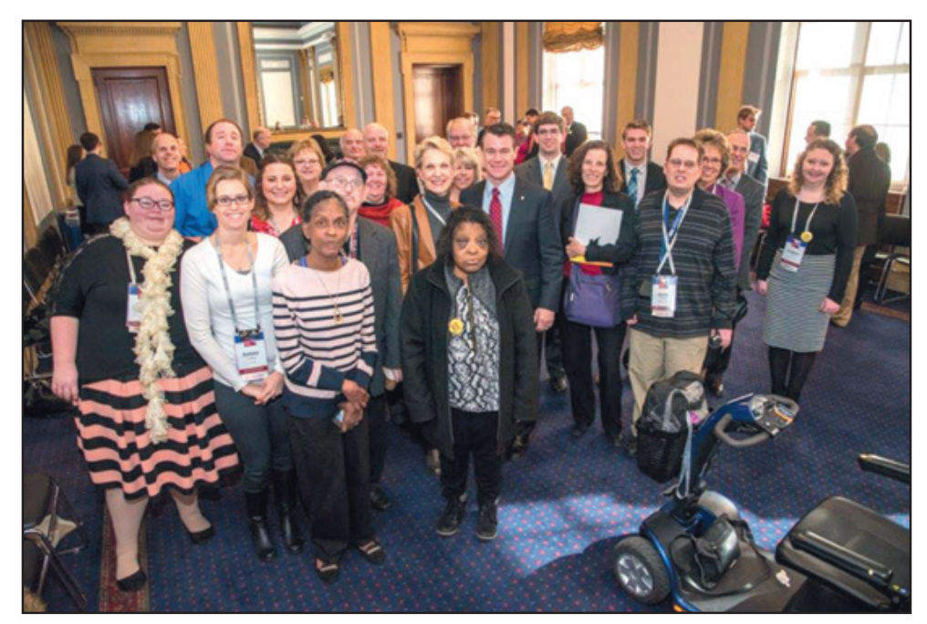
A delegation of 30 leaders of The Arc in Indiana, families, and self-advocates attended The Arc of the United States Disability Policy Seminar in March. Advocates spent time learning about critical federal issues facing people with disabilities and their families, including efforts to repeal the Affordable Care Act and make significant cuts to Medicaid. The final day of the seminar was spent meeting and talking with Indiana's congressional delegation, including Senator Todd Young.

These types of cuts would be devastating to me/us and other people with disabilities and their families.