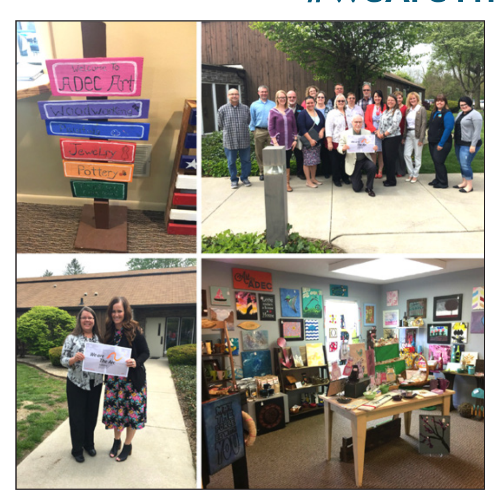
ADEC, The Arc in Elkhart County