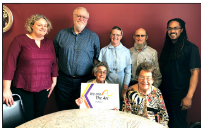
The Arc of Carroll County

The Arc in your area? They would welcome your help! You can find a listing of chapters and contact information on our website at: www.arcind.org/about-the-arc/local-chapters