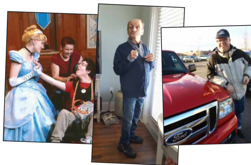
Whether its new clothes, a new truck, or a trip to Disney World, The Arc Master Trust can help provide for disability and nondisability related expenses for trust beneficiaries.