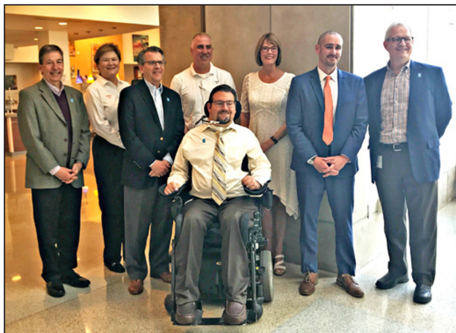
EGTI Southwest project partners and Lt Governor Suzanne Crouch.