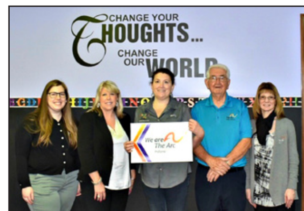
The Arc of Shelby County