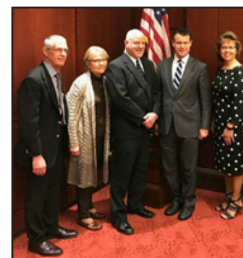
Senator Young with The Arc of LaGrange County

A strong delegation of leaders and members of The Arc of Indiana, chapters of The Arc, and Self-Advocates of Indiana attended the The Arc's Disability Policy Seminar in Washington D.C. in April. The seminar included visits "on the hill" with Senators Joe Donnelly and Todd Young; Representatives Trey Hollingsworth, Jackie Walorski and Larry Buschon, and legislative assistants to Representatives Jim Banks, Pete Visclosky, Luke Messer and André Carson.