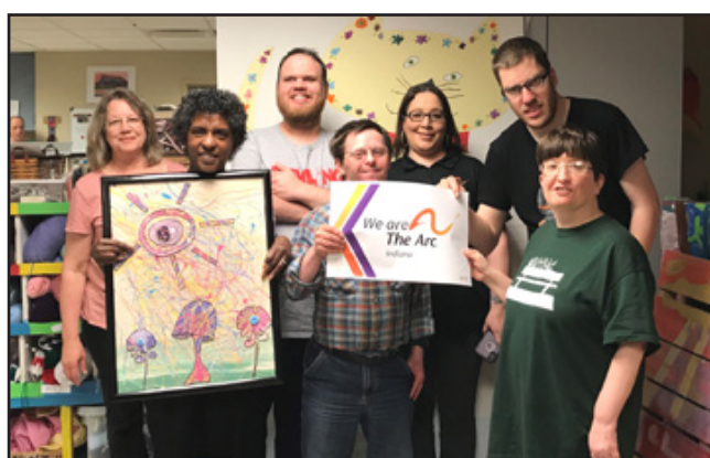
Passages, The Arc of Whitley County