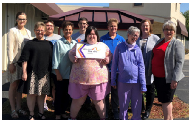
The Arc of Greater Boone County