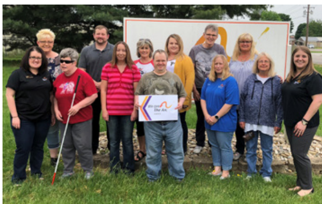
The Arc of Pike County