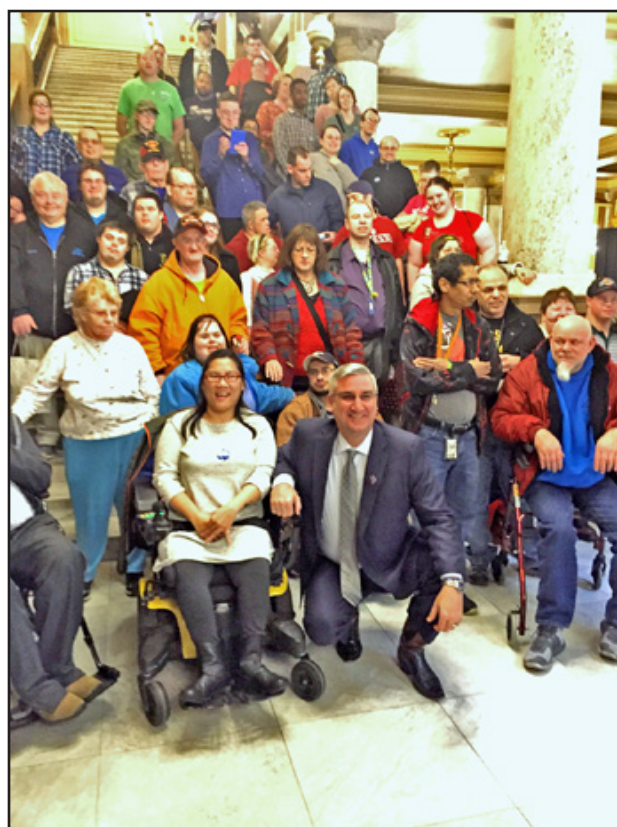
Governor Eric Holcomb met with members of Self-Advocates of Indiana and leaders of local chapters of The Arc at The Arc of Indiana’s annual Valentine’s Day at the State House event.

Following is a summary of education bills and other legislation important to people with I/DD and their families that were passed into law during the 2018 state legislative session.