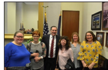
Senator Donnelly with Self-Advocates of Indiana