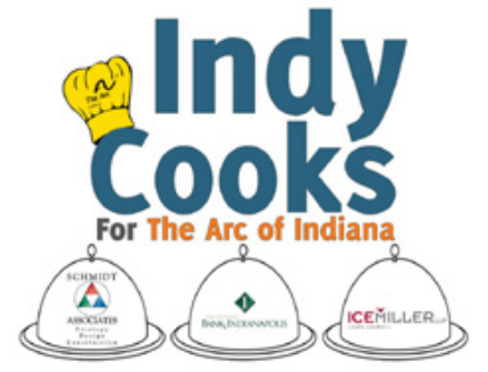
Learn More & Register! www.arcind.org

From The Arc's Membership Committee, "Thank You!" for your membership and support!