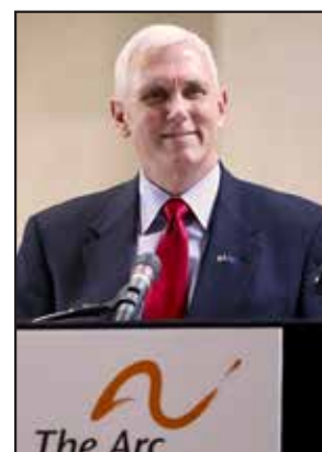
Governor Mike Pence speaking at the training institute and teaching hotel announcement.

tive officer of Arc Innovations. "We are proud to be in a state where economic development opportunities include people with disabilities and greatly appreciate Governor Pence's commitment to assuring all Hoosiers have opportunities to develop job skills that will lead to employment."