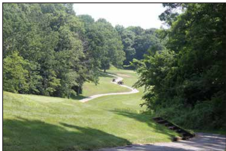
Support The Arc and enjoy a day of golf at beautiful Eagle Creek Golf Club.