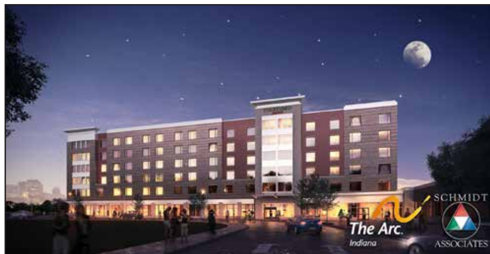
Architect's photo rendering of the Training Institute and Teaching Hotel

nation will provide postsecondary education opportunities for people with disabilities in the hospitality and food service industries, train human resource professionals in hiring people with disabilities, employ people with disabilities at the Courtyard by Marriott and offer the opportunity for people with disabilities to own their own business in the hotel.