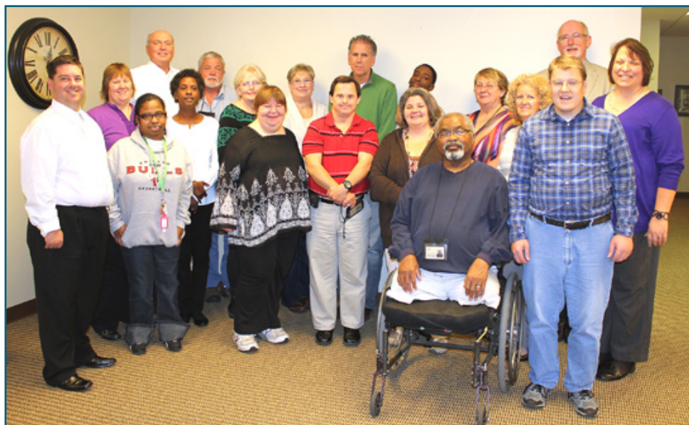
The My Life, My Choice Team

"I let them know that we are here to help and, hopefully, that can allow them to breath and begin to take those next steps. Other people did that for me, and my son would not be where he is today without that help."