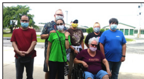
Bi-County Services, The Arc in Adams and Wells County's Fit Bit Walking Group

The new state fiscal year began on July 1. State agencies were charged with reducing their budgets by 15% due to COVID-19's impact on the state budget. The Division of Disability and Rehabilitative Services announced that they were reducing a number of state contracts, including a contract with The Arc of Indiana. They also eliminated the state funded caregiver support/respice care program, state funded community based sheltered work, and state funded facility-based sheltered work.