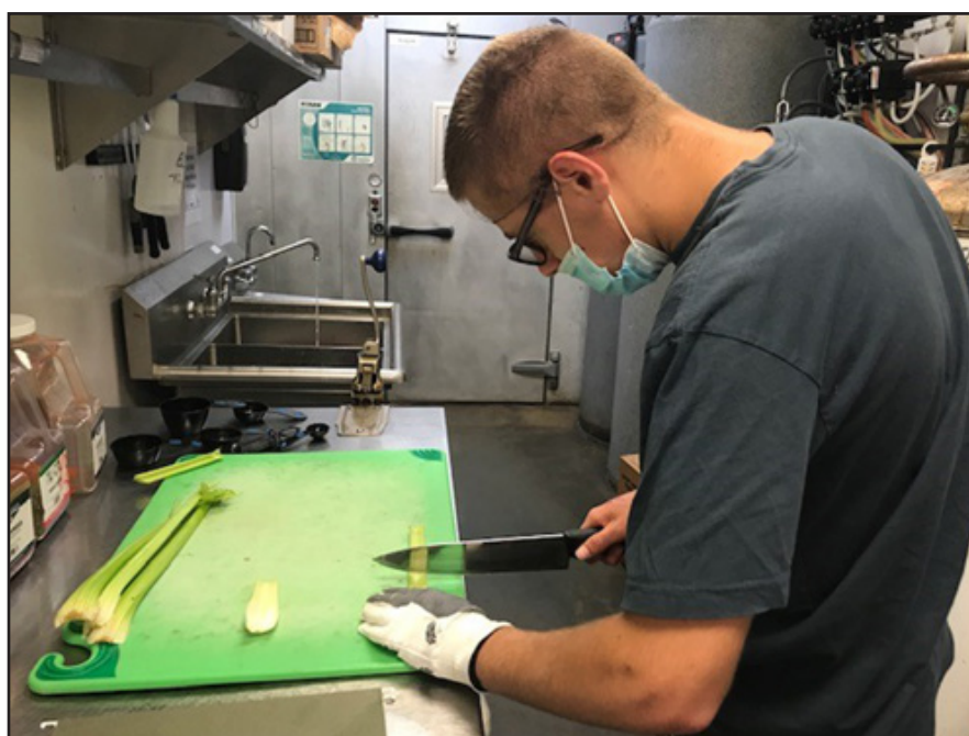
Training as a kitchen cook is one of EGTI's training programs.