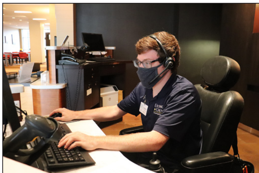
Training as a front desk agent is one of EGTI's training programs.