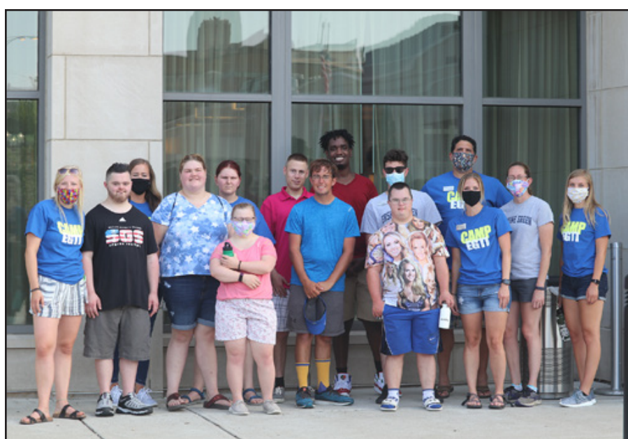
EGTI hosted the first Camp EGTI in July 2020.

The curriculum also addresses critical soft skills like appropriate workplace etiquette, teamwork, taking direction, and effective communication skills.