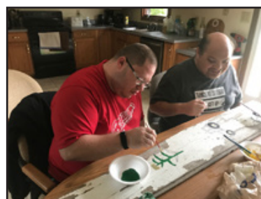
Sycamore Services, The Arc in Hendricks County, has incorporated creative projects for residential clients.

The Arc's contract with the state helped fund our efforts through The Arc Advocacy Network. However, the board and leadership team at The Arc