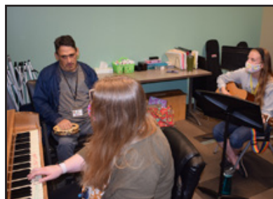
Hillcroft Services, The Arc in Delaware County, has resumed in person music therapy.

It is important to stress that this does not impact any Medicaid Waiver services, including pre-vocational sheltered work services funded through the waiver, people living in Medicaid funded group homes who attend sheltered work programs, and people living in nursing facilities who receive federal funding to attend day programs, including sheltered work.