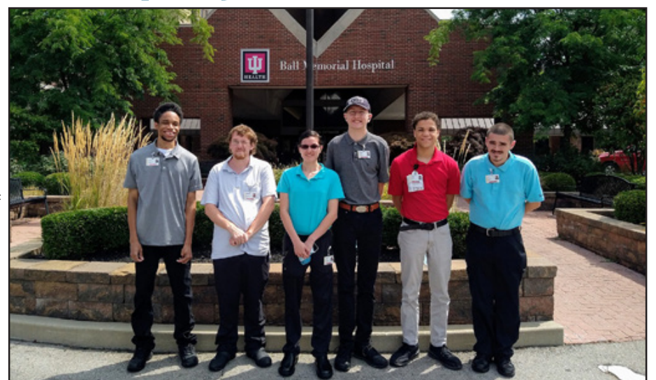
Students enrolled in EGTI's Health Care Support program interned at IU Health Ball Memorial Hospital and look forward to future careers in nutrition services, environmental services, and patient transport.

Being afforded the space to train and receiving buy-in from IUHBMH employees who play a role in training EGTI students – both of these are extremely important. However, the most important component is employment opportunities after graduation. EGTI is pleased to report that IU Health has hired nearly 25% of its healthcare graduates across seven IU Health hospitals: IU Health Ball Memorial Hospital,