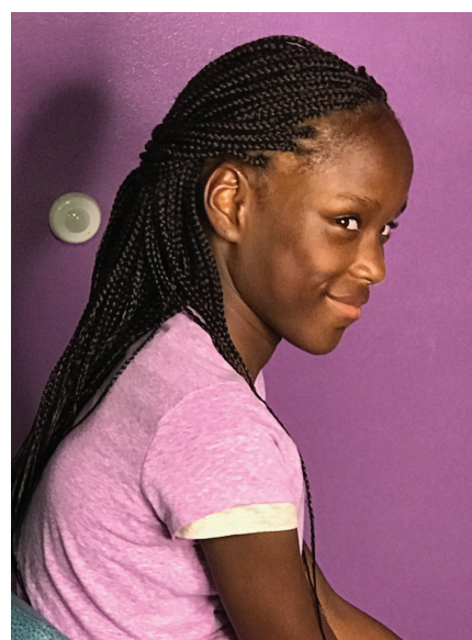
Ruby's new braids.