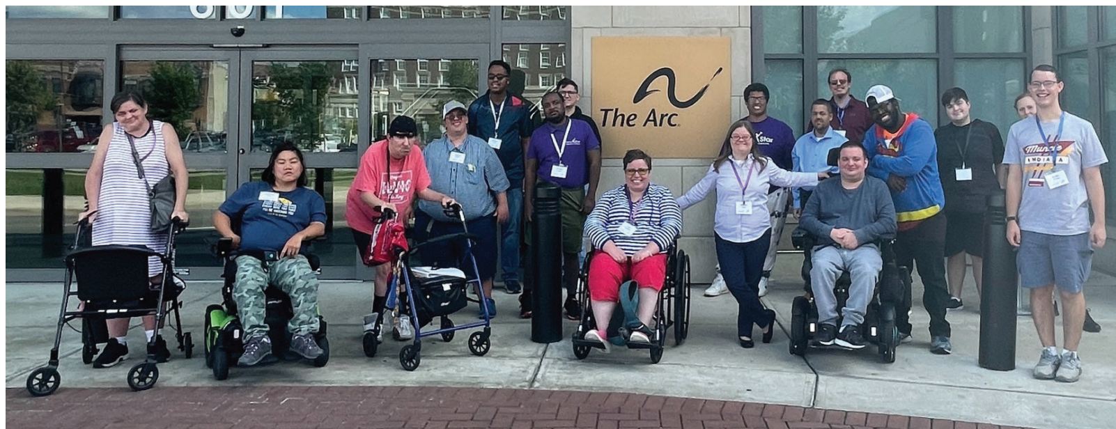
Participants in The Arc of Indiana and Self-Advocates of Indiana's leadership training program gather in front of the Courtyard by Marriott Muncie at Horizon Convention Center, home of The Arc of Indiana Foundation's Erskine Green Training Institute and the nation's first teaching hotel.

With the election coming up on November 8, SAI encourages you to visit indianavoters.in.gov to check your voter registration, learn where