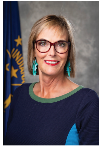
Lt. Governor Suzanne Crouch kicked off Disability Awareness Month on March 1st by joining The Arc of Indiana, Erskine Green Training Institute and Muncie Mayor Ridenour at EGTI to discuss the importance of hiring Hoosiers with disabilities.

Indiana ... A Place that Works ... for All! Sounds great doesn't it? Sounds relatively simple as well, doesn't it? But it is not.