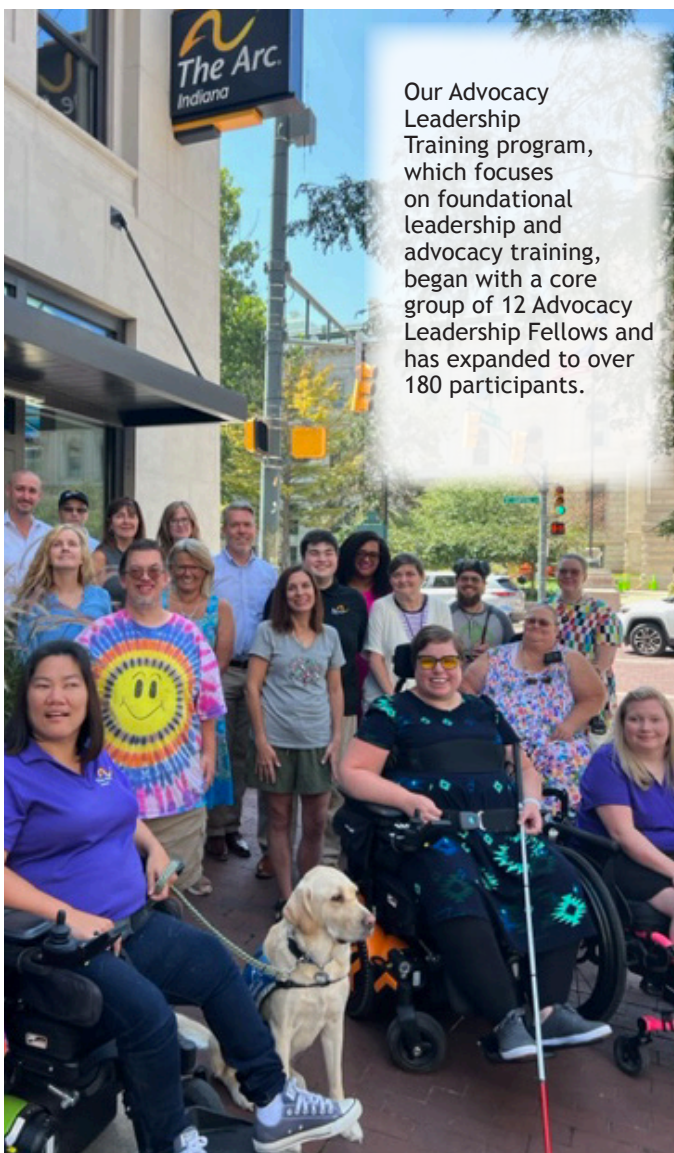
Our Advocacy Leadership Training program, which focuses on foundational leadership and advocacy training, began with a core group of 12 Advocacy Leadership Fellows and has expanded to over 180 participants.